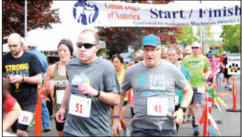
Runners at the start of the race on June 2.