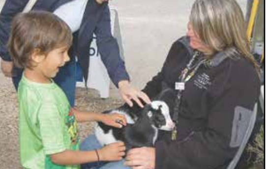
The baby goat in Puyallup brought smiles.