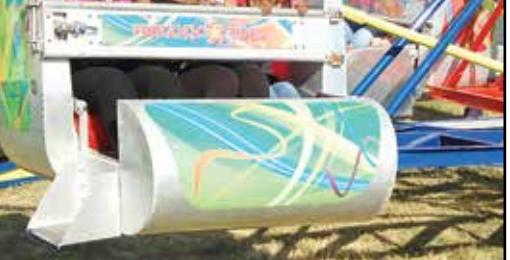
All smiles on the scrambler.