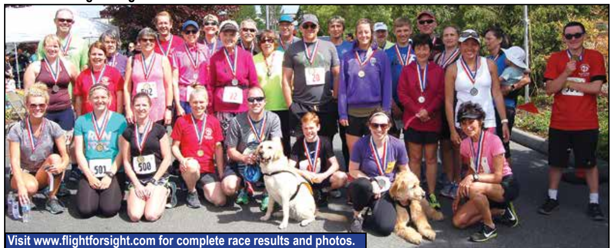
Top two finishers in each age category for both the 5K and 10K pose for a group photo.