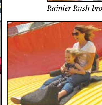
Giant slide is family fun!