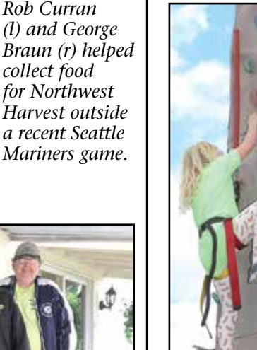
Kids tackled the rock