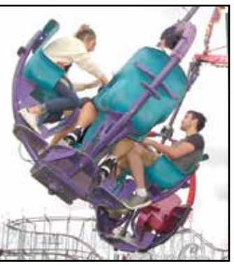
Thrill rides at the Puyallup.

Rainier Rush brought screams in Puyallup.