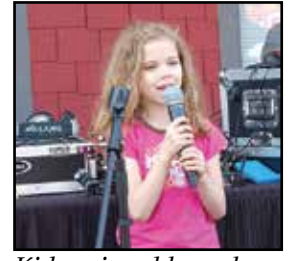
Kids enjoyed karaoke at the Puyallup site.

Above: The Puyallup Fair mascot greeted families.