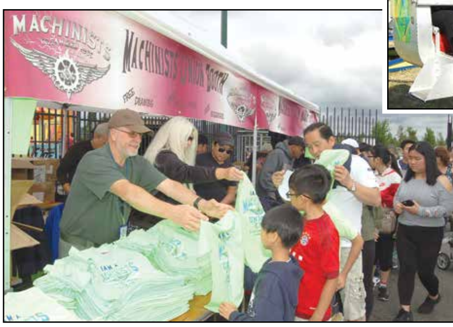
Machinists kid and member t-shirts were given to thousands at both sites while supplies lasted.

In Puyallup kids pumped water for duck races in the farm area.