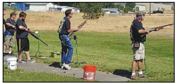
The Local 86 Trap Shoot will be Saturday, August 25. The event raises money for Guide Dogs of America.