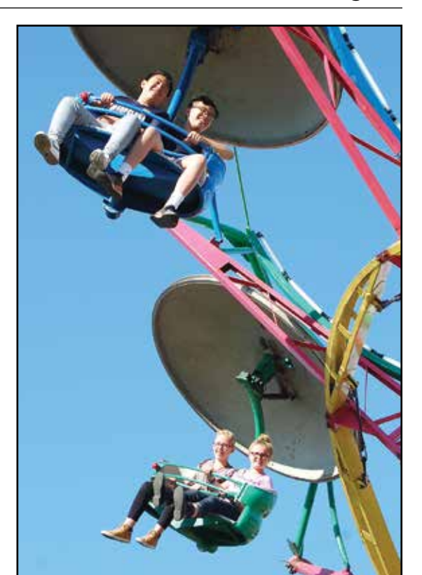
Paratrooper ride in Puyallup.