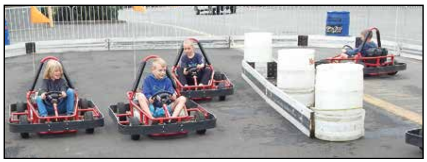
At Monroe, kids tested their driving skills on the go-kart track.