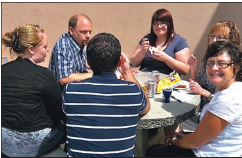
A hotdog and hamburger feed and raffle in Yakima raised an additional $1,400 for Guide Dogs of America.