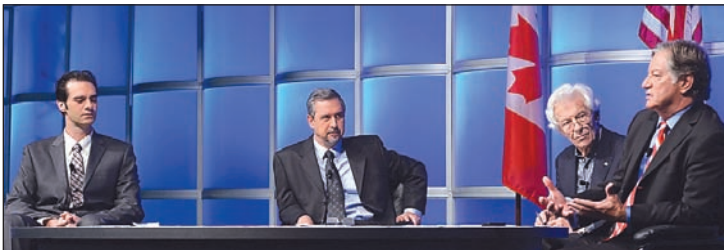
Panel discussion on health care entitled: Health Care – A Universal Right, A Global Blight, an International Fight sparked lively discussion.