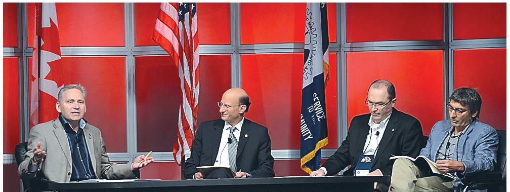
The panel “Making the Case for Global Solidarity” included prominent labor leaders from Brazil, England and Spain, as well as Owen Herrnstadt from the IAM.