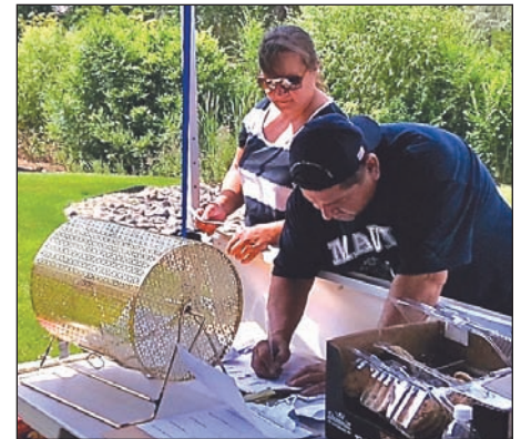
Members bought raffle tickets and enjoyed the barbecue in Yakima.