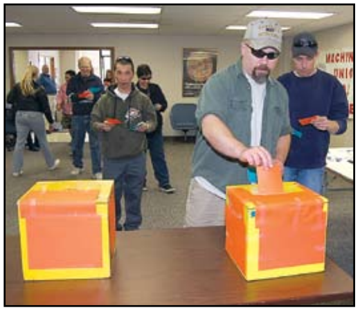
Members at Triumph in Spokane ratified a new 3year agreement by 81 percent on June 3. It provided job security to the 335 members.

s for Airbus planes. ar, members at the Spokane facility have worried about what Triumph's new plant in Mexico would mean to their future. Management had reported that 50 Spokane jobs would initially move to Mexico, but that could grow to more. With the new contract rati-