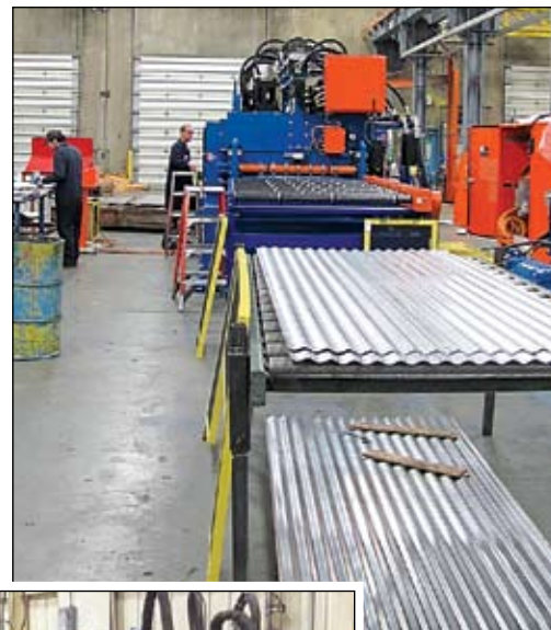
Above: Some of the panels produced at ASC Machine Tools.