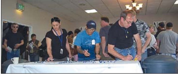
Photo left: Members from Triumph Composites showed tremendous solidarity when they voted more than 99 percent to grant Union negotiators strike authorization on April 19.

After receiving a strong show of confidence from the members on April 19 with a more than 99 percent strike authorization vote, Union negotiators opened formal contract talks with Triumph Composites Systems on May 4.