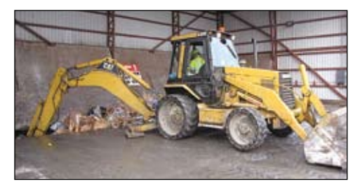
Ed Wright working at one of the transfer stations.