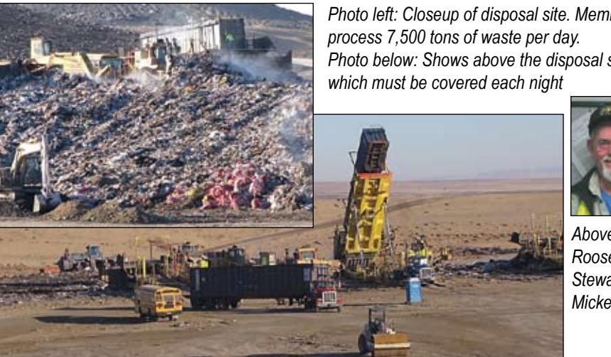
Photo left: Closeup of disposal site. Members Photo below: Shows above the disposal site.