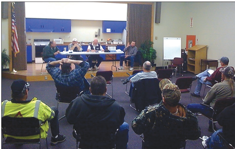
Members in Goldendale met with Union leaders and reviewed each article of the contract to help formulate proposals for their upcoming negotiations this fall. The current contract expires in November.

With over 120 Machinists Union members, this is one of the larger employers in Klickitat County. This is the tenth largest landfill in the country and the largest waste by rail operation in the United States – making their jobs vital to not just Eastern Washington, but the entire Pacific Northwest region.