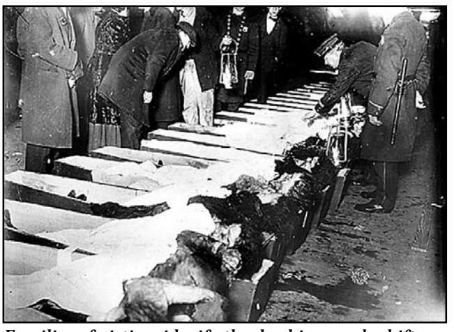
Families of victims idenify the dead in a makeshift morgue. With so many dead, the city's morgue had to be moved to accommodate the 148 victims.

Workers immediately began filling buckets with water to douse the flames, but it didn't take long to realize that the fire could not be stopped and the flames quickly spread through the ninth and tenth floors. Trying to flee the building, workers found that the exits had been locked by supervisors to prevent breaks and keep union organizers out. Further frantic searching for a way out of the flaming building led to the discovery that both the building's elevators were not working. And, the sole fire escape