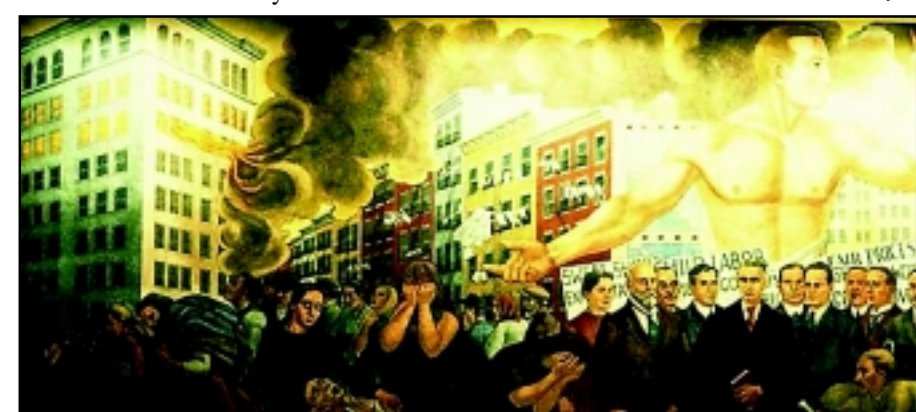
A mural commissioned by the ILGW on the Triangle Shirtwaist Fire tragedy.

The loss of 148 lives in the Triangle Shirtwaist Fire created a devastating blemish on American history. But its influence on the labor movement cannot be measured. The loss of the poor women who suffered that day connected a nation and ensured that workers today would have a safer place of work. That is why these voiceless martyrs to the cause of social and labor justice should stand at the forefront as we look back and celebrate women's history this month. Their silence far more deafening than any powerful speech; these Jane Does are the true heroes of history.