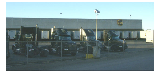
The UPS hub in Spokane.