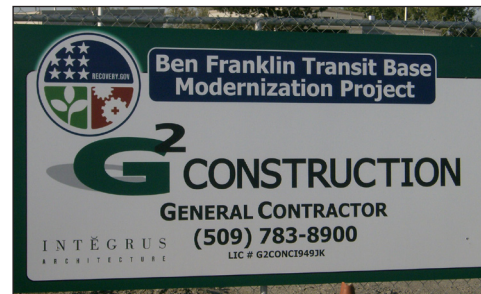
The sign indicating Federal stimulus funds to update Ben Franklin Transit Base.

IAM members at Ben Franklin Transit in the Tri-Cities are seeing an expansion of their maintenance facility with federal stimulus money. It is important to see these improvements to the facility, and we are hopeful they will translate into additional jobs and job security for our members there.