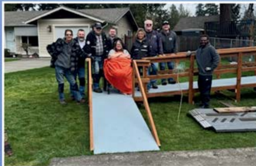
Lake Tapps, WA