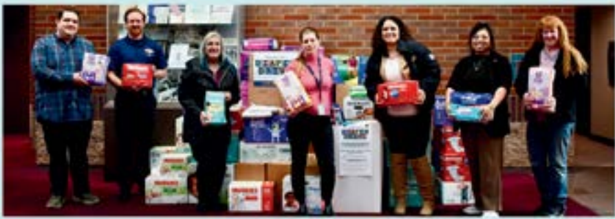
Small items, big impact! IAM 751 Members stepped up for the 'Do the Right Thing Nonprofit' diaper drive, collecting 8265 diapers and 4402 wipes for families who need them most. Thank you to every member who dropped off donations. When IAM 751 Members do better, we all do better in the communities we call home.