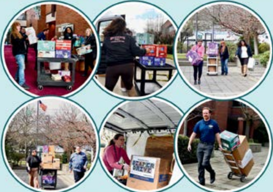
Sponsored by the IAM 751 Women's Committee to support the non-profit 'Do the Right Thing.' Find out more at www.dotherightthingnonprofit.org .