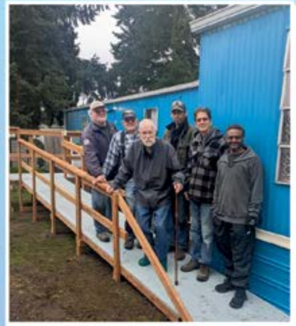
Federal Way, WA